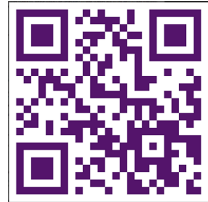
Shortened link to thedetailperson.com

More data creates smaller patterns which are difficult for scanners to read. A URL shortener can create an easy-to-read QR code AND statistics for the channel.